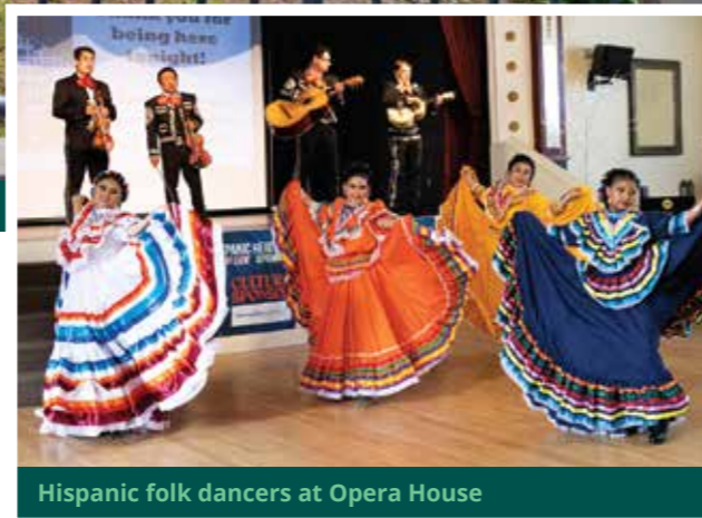
Hispanic folk dancers at Opera House

Speaking of views, the Bayview Trail along the Bayview-Whiskey Ridge corridor in east Marysville offers soft hills and exceptional views of the city and Port Gardner Bay, then extends into a wooded section to the north to connect with the regional Centennial Trail near Highway 9.