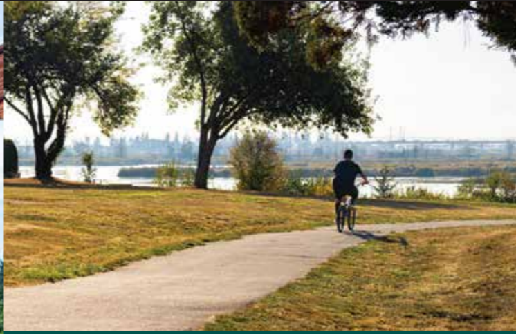
Miles of trails to enjoy