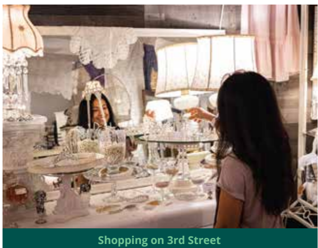
Shopping on 3rd Street

What's on your shopping list? There's a good chance you'll find it in Marysville.