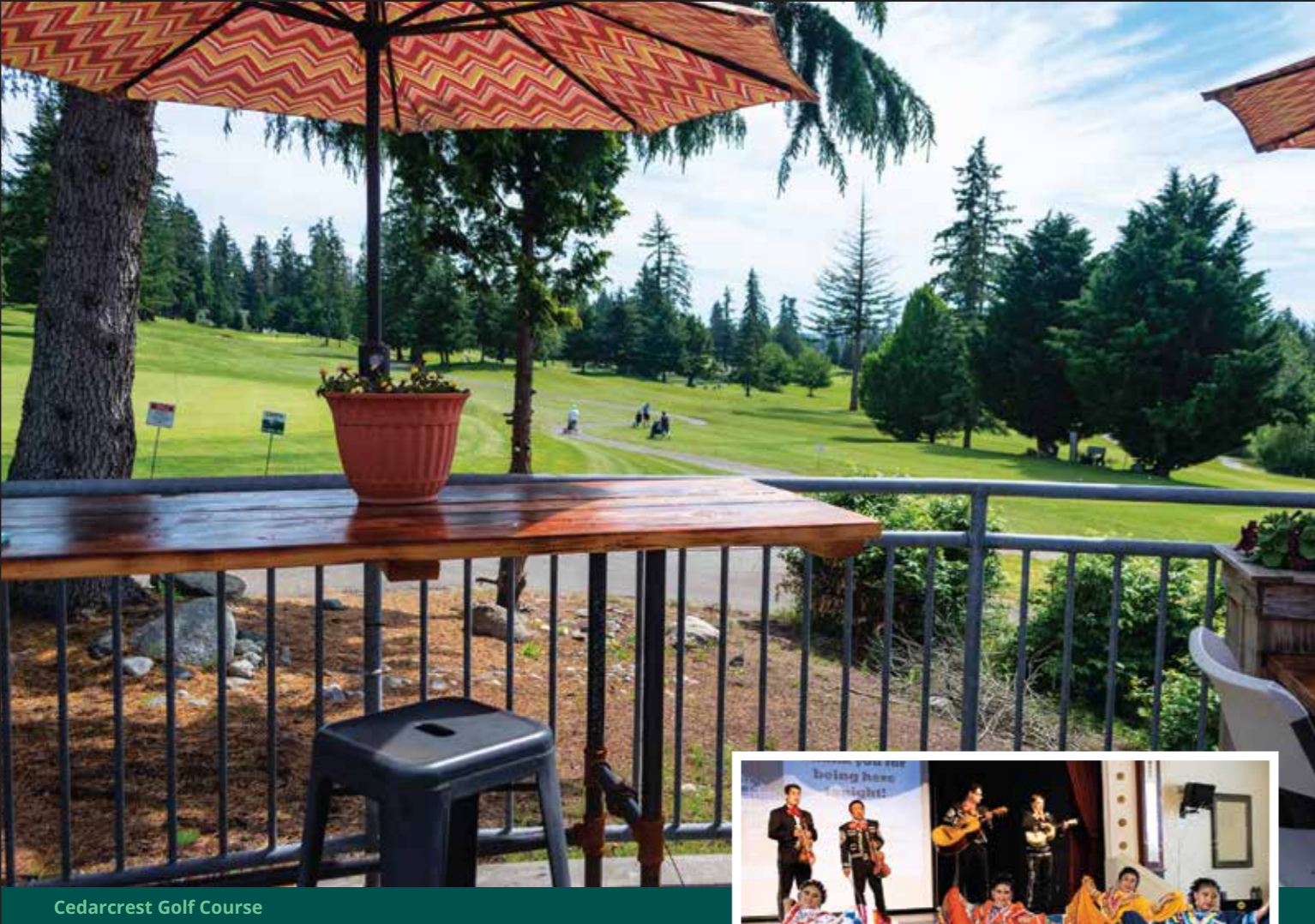
Cedarcrest Golf Course