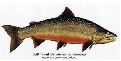
Bull Trout Salvelinus confluentus male in spawning colors

Bull Trout Distribution Quilceda-Allen Watershed Streamnet.org Dec., 2014 Download. Compiling Agency: Washington Dept. of Fish and Wildlife.